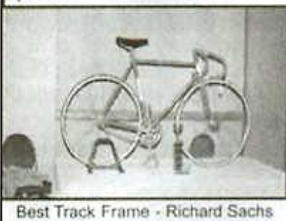
Best Track Frame - Richard Sachs

The First Annual North American Handmade Bicycle Show was held in Houston over January 15-16. The event brought frame builders from all over the country (and one from Italy) to display their works, but more importantly, to discuss ideas with other builders and cyclists.